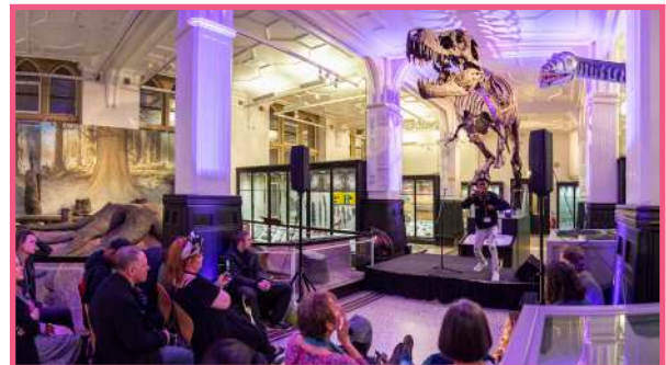
Manchester Museum (WOV Summit and Fest)

The Old Diorama Arts Centre (London) runs a purpose-built complex of rehearsal rooms, studios, meeting rooms and exhibition space, a few minutes' walk to the west of Euston station. The income it earns by hiring space for casting, rehearsals, filming and other activities, pays for its own creative programme. One element of this is a residency for an emerging artist. Artists can apply to have a studio for three months, free