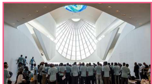
Uma So Voz performance at Museum of Tomorrow