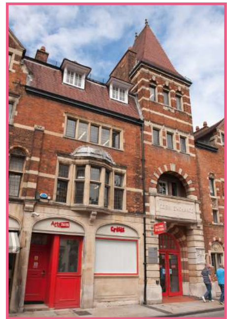
Old Fire Station Credit Crisis UK

The Old Fire Station in Oxford (UK) "is a public arts centre presenting new work across art forms, supporting artists and including people facing tough times." This choice of vocabulary invites people to relate to "tough times" of their own and helps those who have not experienced homelessness to think about how "tough" it might be. The Old Fire Station is owned by Oxford City Council and had been a cultural space for decades before it was remodelled and reopened in 2011. The building is run by Arts at the Old Fire Station (a charitable company set up by the Council) in partnership with the homeless charity Crisis. The Arts at the Old Fire Station Trustees' report explains: "Through this partnership, we offer people who are homeless space to define themselves and choose their own labels by including them in the running of the centre. We look for ways of including others who are socially isolated and disadvantaged. This improves the quality of what we do, helps develop networks, builds resilience and leads to more stable lives. We do this, with Crisis, by offering a public space which is shared by very different people and helps to break down barriers and promote solidarity in Oxford. We prioritise building good quality relationships within our team, with our public and with partner organisations."