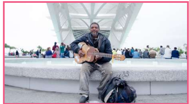
Museum of Tomorrow (Rio de Janeiro)

Montreal Museum of Fine Arts (Canada) describes itself as "a bold, innovative and caring museum". Its response to homelessness is part of a much broader