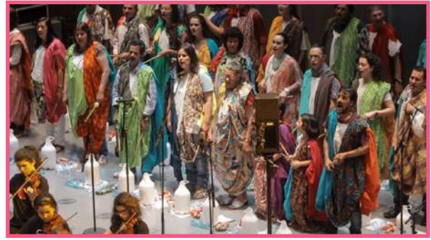
Som da Rua choir and band, Casa da Música

the most excluded people (homeless, at risk, living in social institutions) and to collaborate with social institutions, to build up a fully inclusive musical project," he explained. "Many of these individuals are excluded from society. In our group they are integrated and respected and through musical practice, they [learn] basic rules of democratic life, such as the right to express ourselves, the capacity to listen to others and respect their opinions. Thus, this is definitely also an educational project that develops many relevant skills." Everyone was welcome to join. No audition or previous musical experience was required.