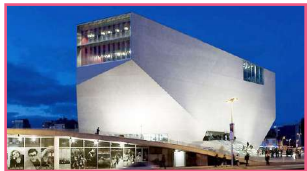
Casa da Música Porto