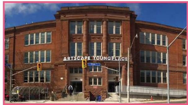
Artscape, The Sketch building, Toronto

Other examples of this approach include the Booth Centre in Manchester, UK which hosts regular performances and exhibitions; the Rainbow Soulclub at the Blaka Watra walk-in centre, Amsterdam, the Netherlands; 12 the Pe:ar in Portland, USA; 13 Sketch in Toronto, Canada; 14 Shedia, the street paper in Athens, which has built a new café with exhibition space; 15 Emmaus Solidarité in Paris, 16 and Crisis which has Skylight buildings around England in which activities, exhibitions and performances take place.