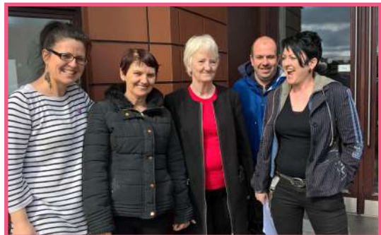
Scotland Review, Co-Researchers group

The featured organisations may not use these headings themselves and may not think of their activities in this way but, while there is some repetition and overlap, we hope this structure provides readers with a helpful way to explore different responses to homelessness and to