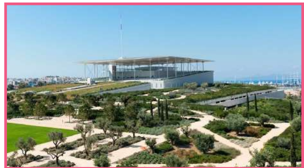
Stavros Niarchos Foundation Cultural Centre and gardens (Athens)

opened in 2017, on the south side of Athens (Greece). It was conceived by the Greek government and the Stavros Niarchos Foundation, a charitable foundation with a history of financing activities to reduce homelessness. The mission of the SNFCC is: "The creation of a public space open to all, where everyone has free access and can participate in a multitude of cultural, educational, athletic, environmental and recreational activities and events." The building, which houses the National Library of Greece and the Greek National Opera, is set in a huge, landscaped park, which is considered to be equal in importance the two "institutions" inside. By the end of 2019 the SNFCC had delivered 9,000 events, most of them free.