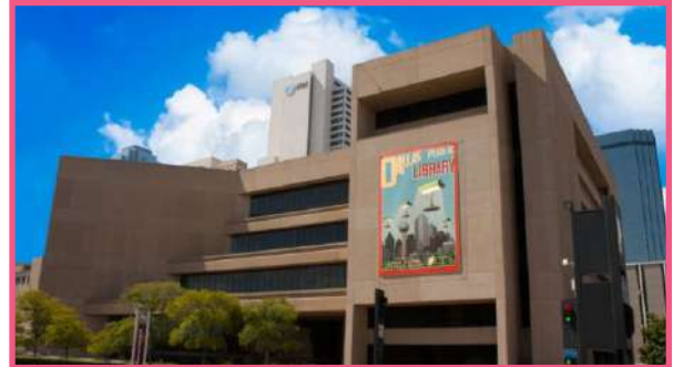
Dallas Public Library