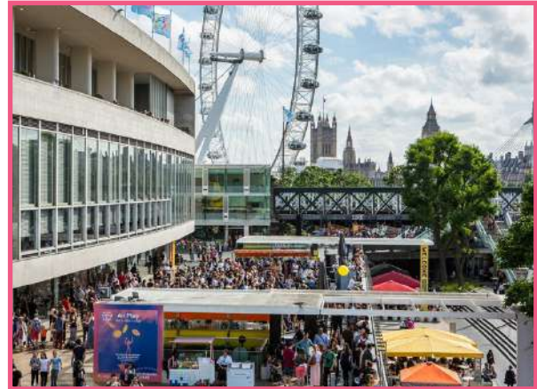
Southbank Centre