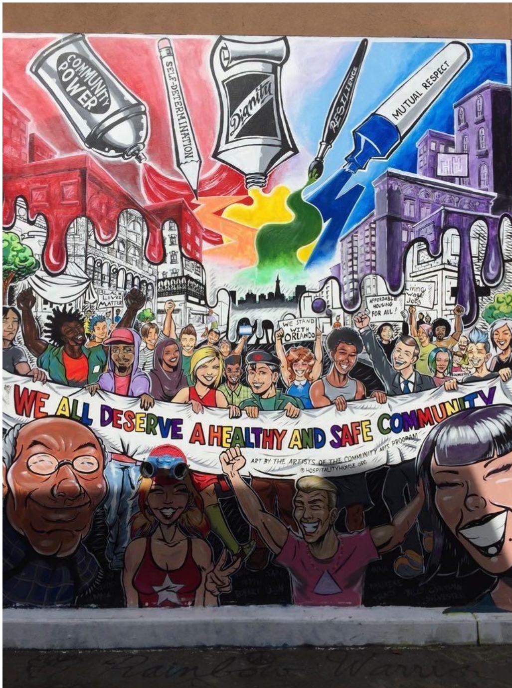
Hospitality House, Clarion Alley Project, San Francisco, CA